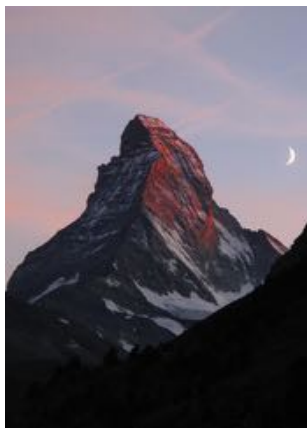
Sunset on the Matterhorn