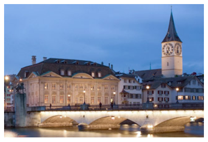
Zunfthaus zur Meisen