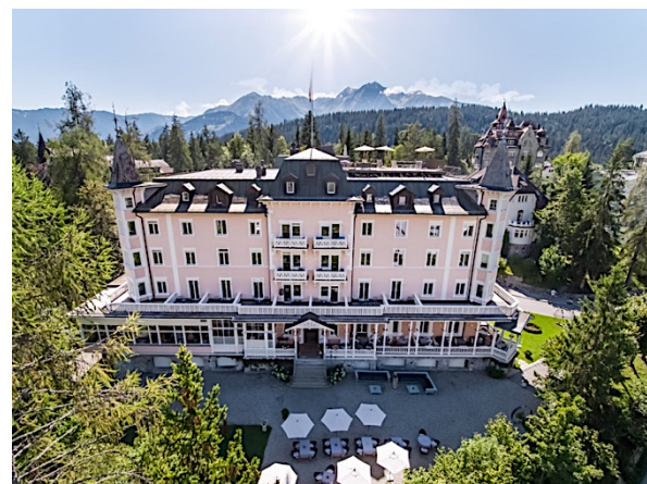
Hotel Schweizerhof and View.

The 4-star Hotel Schweizerhof, registered as a “Swiss Historic Hotel”, offers beautiful panoramic views of parts of the village, meadows and surrounding mountains. All extensions and conversions are in keeping with the Art Nouveau style, so that its character has been preserved both inside and out. In earlier times, the hotel held a ball twice a week, and bridge, tennis and dance instruction. Albert Einstein, Empress Zita and Marie Curie spent their vacations here, and King Albert of Belgium and his wife came incognito. ( https://de.wikipedia.org/wiki/Hotel_Schweizerhof_(Flims) ) Today, the hotel features a wellness area with indoor natural stone pool with Grandeur water and garden/forest view, Finnish sauna, organic pine sauna, steam bath, and infrared cabin. The beautiful Lake Cauma (swimming, lakeside restaurant, etc.) is within walking distance. The rooms (13-23 m 2 / 140-248 ft 2 ) offer panoramic views of the mountains and/or garden/forest, and are equipped with TV, free Wi-Fi, desk, minibar, hairdryer, bathrobe and safe. Some of the rooms feature a balcony or bay window. For a surcharge, a Junior Suite (south-facing balcony with garden/forest view) or a Panorama Turret Room (panoramic bay window with mountain view and seating nook) are available; both have a size of approx. 30 m 2 (323 ft 2 ).