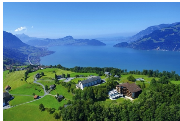
Seeblick Höhenhotel and View.

Early registration is recommended, as space is limited and the Odyssey typically books out. Also, early birds receive a price advantage!