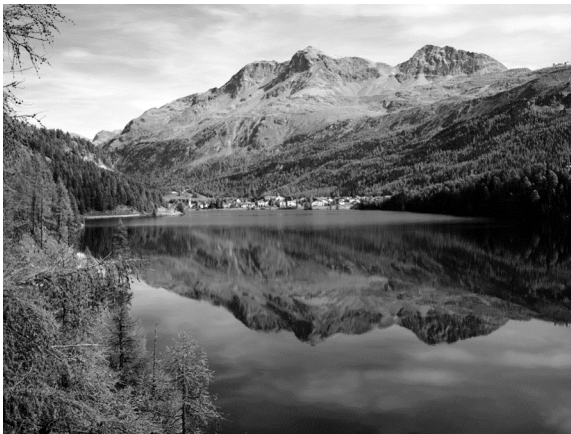
Sils Maria at Lake Sils

sense of psyche. In this setting we illuminate traditional areas of theory—dream, fairytale, expressive arts, body-mind, individuation and the collective. Moreover, theory is advanced through the presentation of new research—and through hands-on exploration of theory applied to personal development and clinical practice.