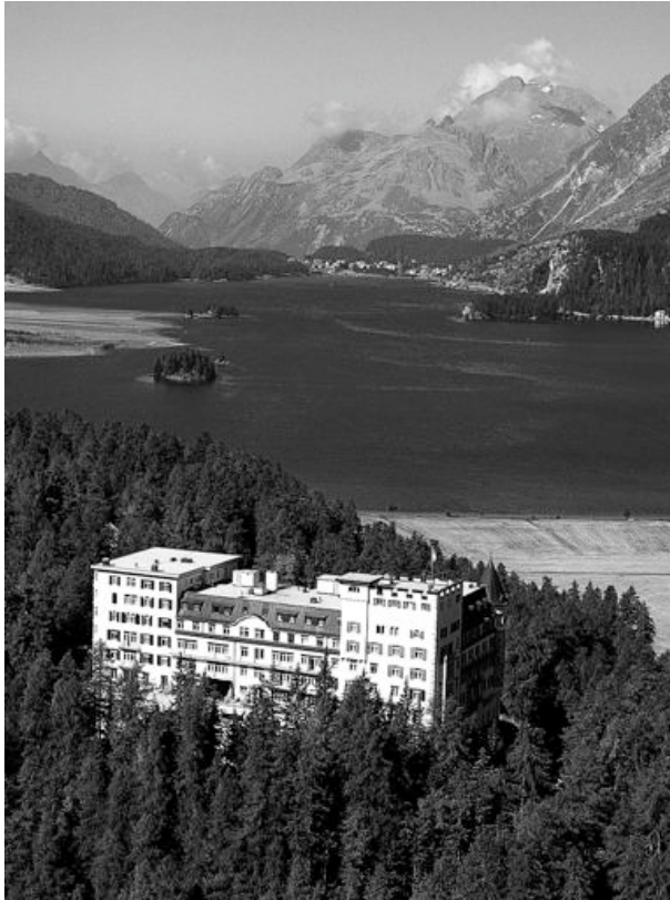
Max Weiss, Courtesy of Hotel Waldhaus

International English-Language Conference & Retreat