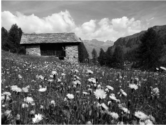
Fex Tal, www.swiss-image.ch